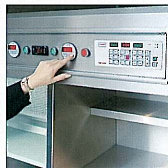
Electronic and computer controls.

Florigo Frying Ranges are hand built by craftsmen and can be designed to fit all shops. The material and components are rigorously tested and meet the highest of European and International standards.