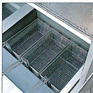
HE-Plus basketpan, sized to fit 2 or 3 baskets.