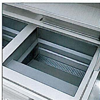
Also suitable for 'free' frying (without baskets).